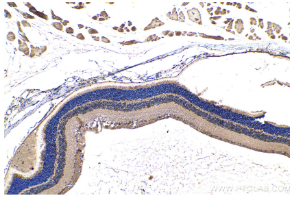
Immunohistochemical analysis of paraffin-embedded mouse eye tissue slide using KHC0355 (MYO3A IHC Kit).