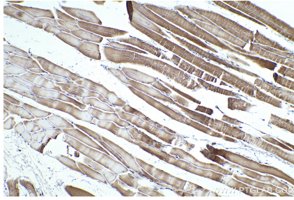
Immunohistochemical analysis of paraffin-embedded rat skeletal muscle tissue slide using KHC0339 (MYH4 IHC Kit).