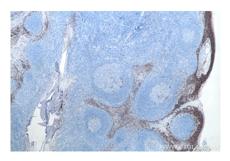
Immunohistochemical analysis of paraffinembedded human tonsillitis tissue slide using KHC0020 (CD138/SDC1 IHC Kit).