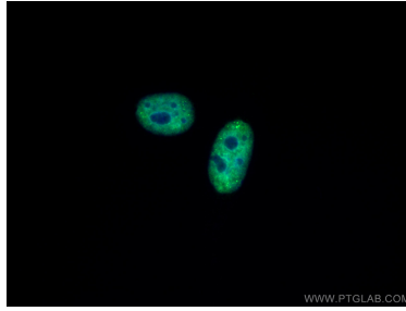
Immunofluorescent analysis of (4% PFA) fixed HepG2 cells using CoraLite® Plus 488 HOXA7 antibody (CL488-67112, Clone: 2A7H6) at dilution of 1:200.