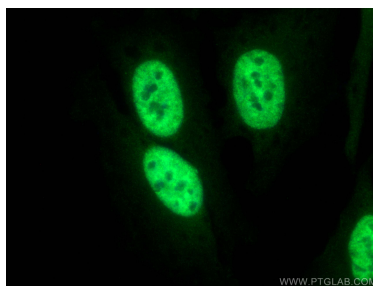
Immunofluorescent analysis of (4% PFA) fixed HeLa cells using CoraLite® Plus 488 HuR antibody (CL488-11910) at dilution of 1:200.