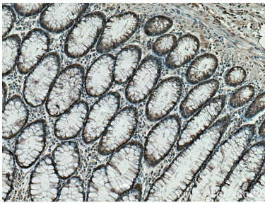
Immunohistochemical analysis of paraffin-embedded human colon cancer tissue slide using 55430-1-AP (STUB1 antibody) at dilution of 1:200 (under 10x lens). Heat mediated antigen retrieval with Tris-EDTA buffer (pH 9.0).