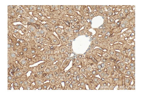
Immunohistochemical analysis of paraffinembedded mouse liver tissue slide using 32381-1-AP (Transferrin Receptor 2/TFR2 antibody) at dilution of 1:400 (under 40x lens). Heat mediated antigen retrieval with Tris-EDTA buffer (pH 9.0).

Various lysates were subjected to SDS PAGE followed by western blot with 32381-1-AP (TFR2 antibody) at dilution of 1:2000 incubated at room temperature for 1.5 hours.