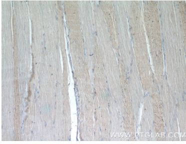
Immunohistochemical analysis of paraffin-embedded human skeletal muscle tissue slide using 25207-1-AP (OSTN Antibody) at dilution of 1:50 (under 10x lens).