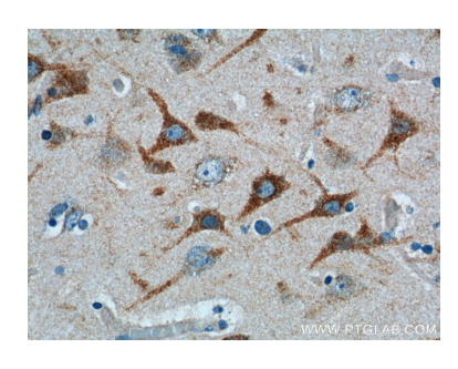
Immunohistochemical analysis of paraffinembedded human brain tissue slide using 23288-1-AP (TRIF/TICAM1 antibody) at dilution of 1:200 (under 40x lens).