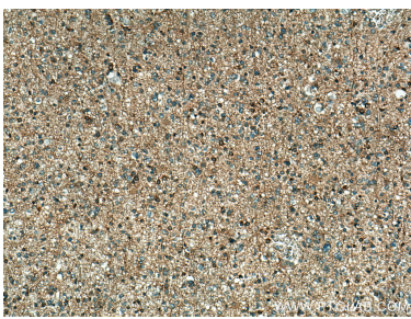
Immunohistochemical analysis of paraffin-embedded human gliomas tissue slide using 10116-1-AP (GDI2 antibody) at dilution of 1:200 (under 10x lens). Heat mediated antigen retrieval with Tris-EDTA buffer (pH 9.0).